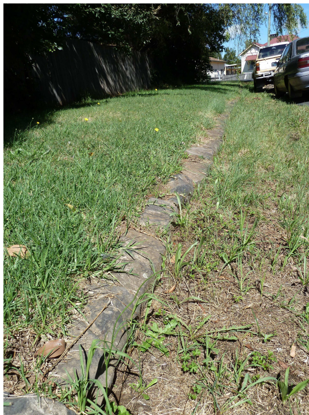
Old stone kerbing, Crescent Street (north) adjoining site