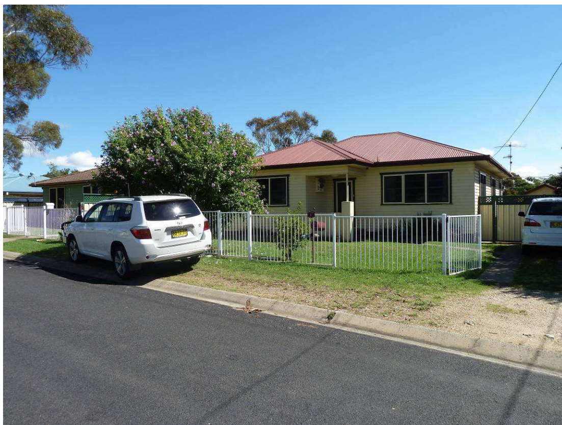
1 Claverie Street